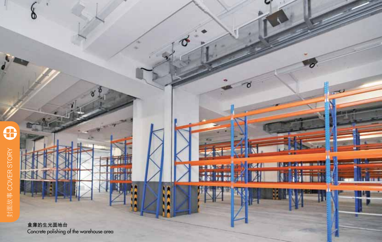
倉庫的生光面地台 Concrete polishing of the warehouse area