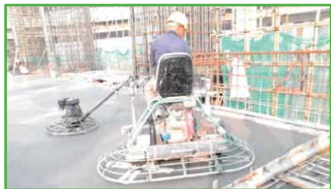
工人使用雙旋轉磨光機打磨地台 Worker uses Sit-on Rider to polish concrete floor

While accepting the pressing need to meet tight schedules, the project team didn't neglect the importance of safety and environmental management. The Interlink is the first of its type to obtain HK-BEAM Gold Standard compliance and a LEED Silver certification in Hong Kong. And it also garnered the Safety Management System Merit Award in the 9th HKOSH Award Scheme awards.