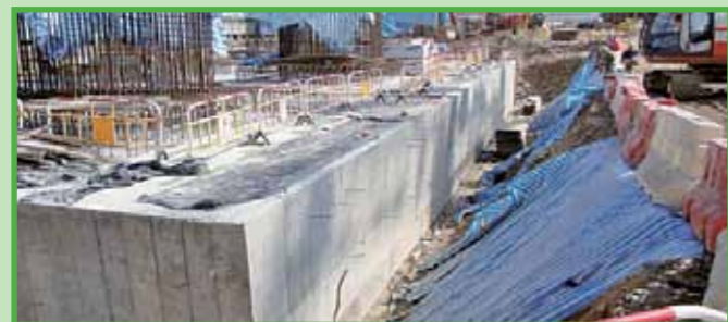
正在興建2,480立方米的樁帽 Construction of the 2,480 m 3 pile cap