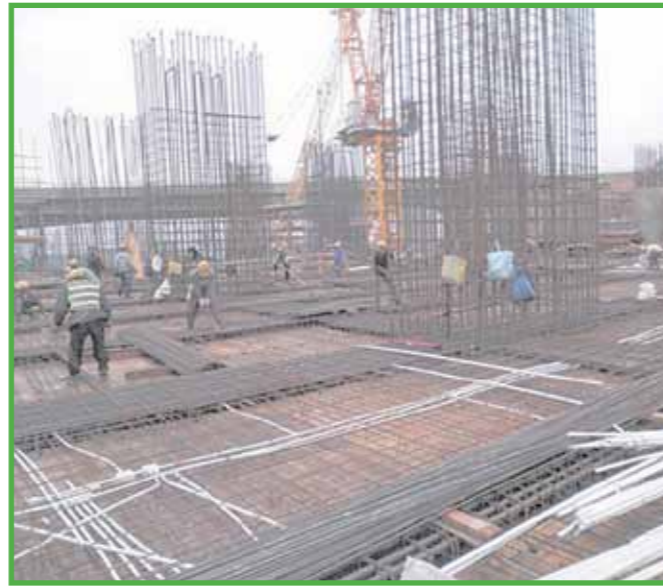
紮樓面鐵 Metal scaffolding for the floors