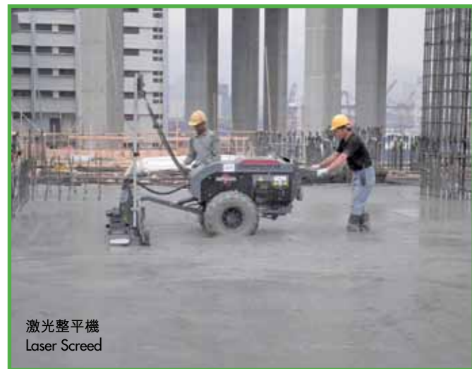
激光整平機 Laser Screed