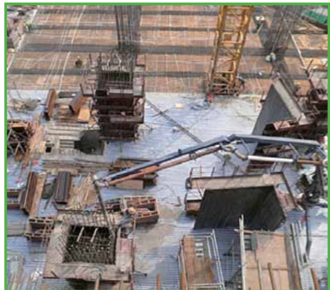
靈活調動流動石矢泵灌注樁柱 Using mobile placing pump to place concrete at convenient locations.