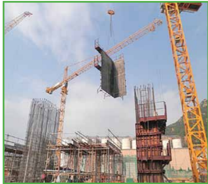
吊運及安裝柱模的情況 Hoisting and installing Column Pillar Mould