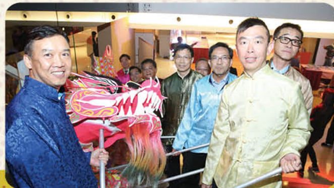
高級管理層舞龍表演助慶 Dragon dance performance by senior management