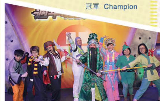
「新復仇者聯盟第108回之 最後無事」(政務科) New Avengers (Administration Division)