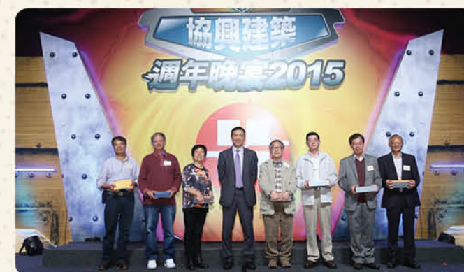
公司向55名同事頒發長期服務獎及榮休獎，感謝他們一直以來為公司作出的貢獻 55 staff members are presented with Long Service Awards and Retirement Awards