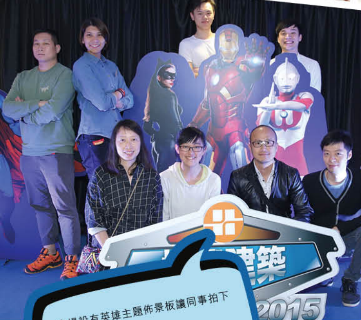
會場設有英雄主題佈景板讓同事拍下 即影即有相片作留念 Hero-themed backdrops are set for colleagues to take instant photos

管理層亦特別藉此盛宴親自嘉許多年來為公司默默耕耘的「無名英雄」。今年，共有55位員工獲頒長期服務獎及榮休獎，其中更有12位得獎者年資達三十年以上。另外，公司同場頒發義工嘉許獎，表揚去年最熱心參與義工活動的30位同事；以及向三支工程團隊頒發「工地安全表現評審計劃獎」，藉此鼓勵各隊伍全力做好安全管理，為工友營造健康、安全的工作環境。