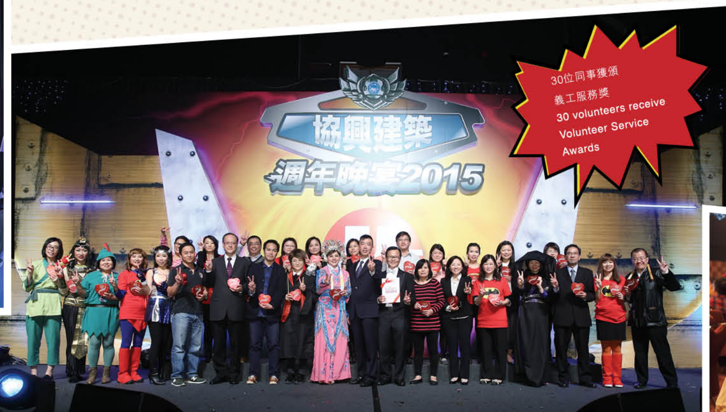
30位同事獲頒 義工服務獎 30 volunteers receive Volunteer Service Awards