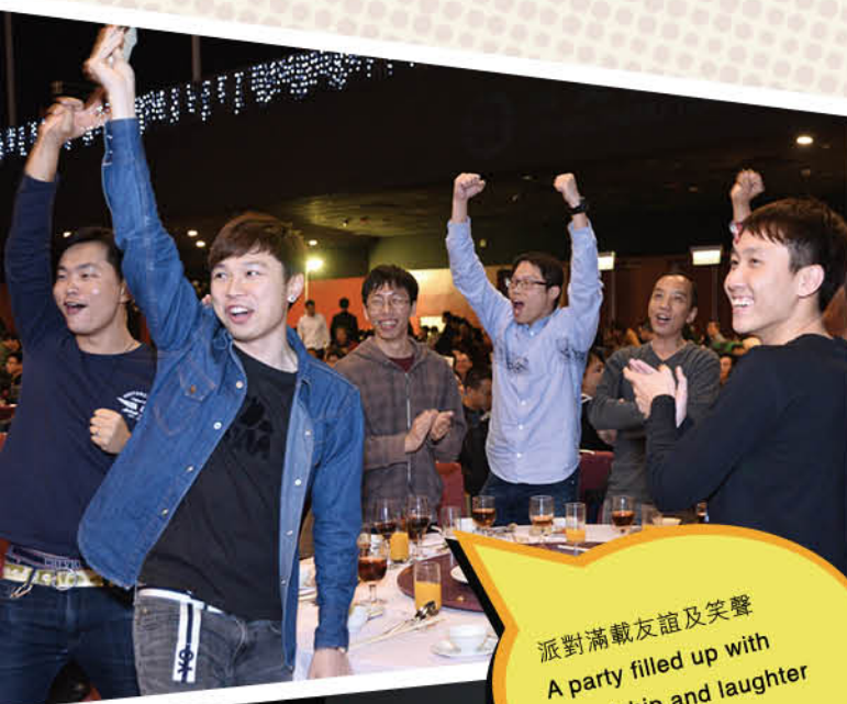
派對滿載友誼及笑聲 A party filled up with friendship and laughter