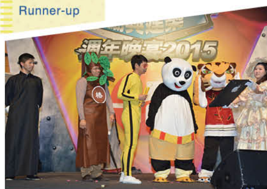
「九個“挑”機的英雄」(機械及物流部) The Nine Heroes (Plant and Logistics Department)